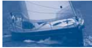
Sun Odyssey 50 DS