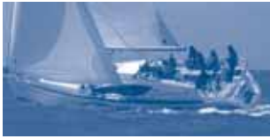
Sun Odyssey 45 DS