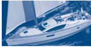
Sun Odyssey 45 DS Performance